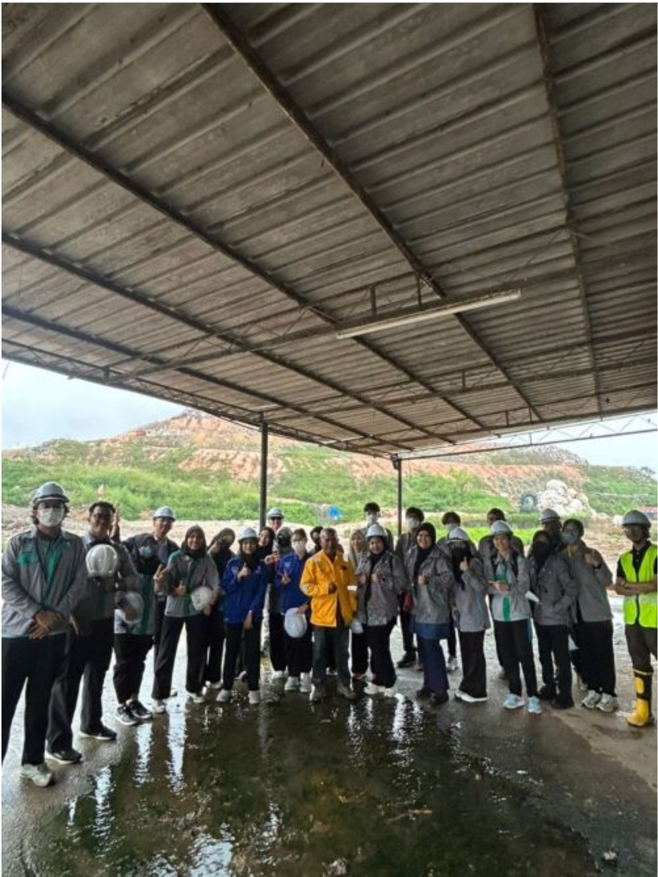
This picture was taken during a BSP4523 Recycling Technology class visit to Gading Senggara Sdn. Bhd., one of the landfills in Jabor, Kuantan. During the visit, students gained first-hand experience of how domestic waste is managed from its arrival by truck to its final disposal at the landfill. They were also introduced to the potential of transforming waste into valuable resources through recycling and