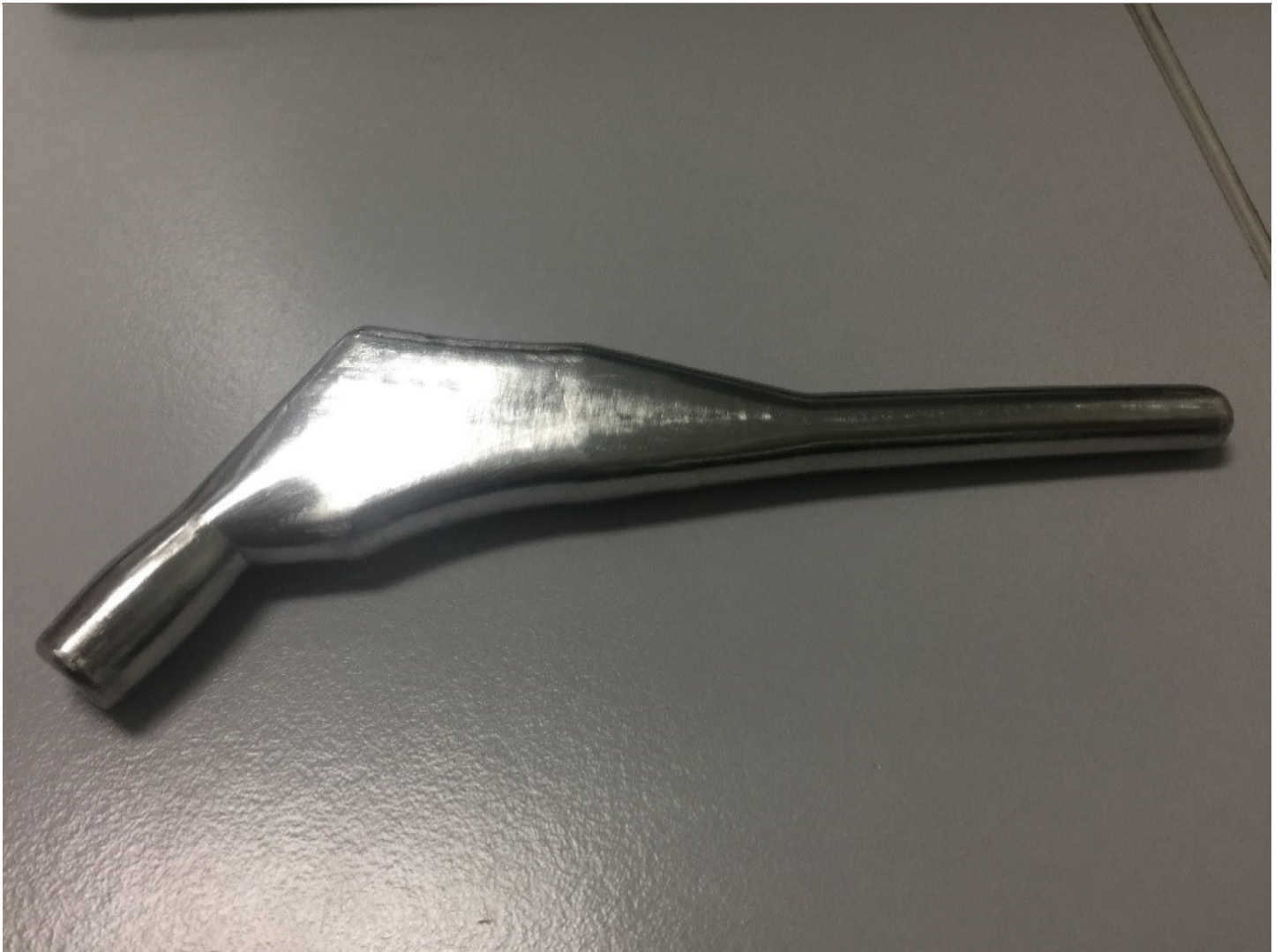
Figure 2: Successful printed hip femoral implant

The skill and higher level of learning in additive manufacturing can be included in a national agenda on the TVET. This skill can enhance the country's requirement for high skill workers. The product that produces from this 3D printing can be imported or used in internal demand. Malaysia should focus on this area more critically and teach the young generation on this skill. There are three critical subjects to be targeted by higher-level TVET skill for 3D printing process which is as shown in Figure 2;