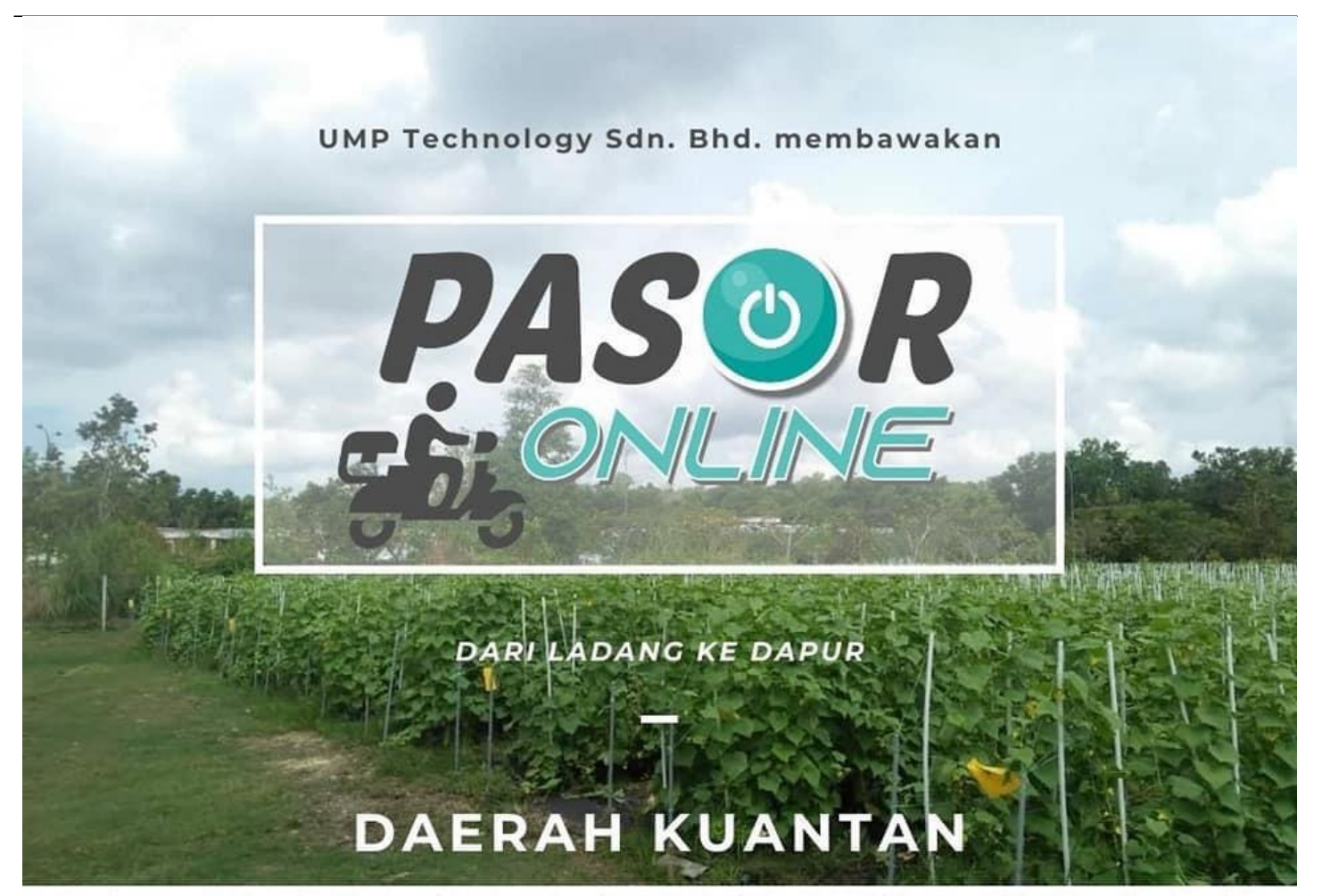
Bandar Indera Mahkota | Bukit Istana | Gambang Jaya | Jaya Gading | Kem Batu 10 | Kg Batu 11 | Kg Melayu Gambang | Kg Kurnia | Kg Pandan | Kg Sungai Belat | Kg Seri Fajar | Kotasas | Permatang Badak | Perumahan Bukit Rangin | Pusat Bandar Kuantan | Seri Damai | Seri Mahkota Makmur | Sg Isap | Taman Guru | Taman Mahkota Aman | Taman Tas