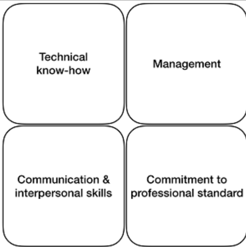
Figure 3: The attributes to be evaluated through all three routes to becoming a Professional Engineer.

The writer is a Senior Lecturer at the Faculty of Mechanical and Automotive Engineering Technology, Universiti Malaysia Pahang (UMP).