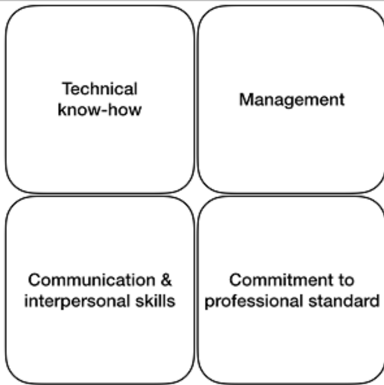
Figure 3: The attributes to be evaluated through all three routes to becoming a Professional Engineer.

The writer is a Senior Lecturer at the Faculty of Mechanical and Automotive Engineering Technology, Universiti Malaysia Pahang (UMP).