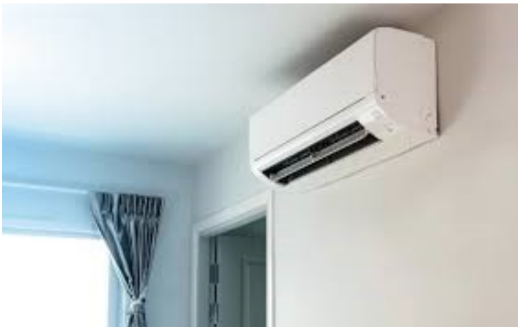
Figure 1: Wall-mounted split unit type air conditioner

An air conditioner is divided into two main categories, namely for domestic and commercial use. In domestic use, the split unit type that consists of indoor and outdoor units is the most popular and frequently used. A common split unit used in homes is the wall-mounted type, as shown in Figure 1 . The capacity of this type is in horsepower (HP) with a selection of 1HP, 1.5HP, 2HP, 2.5HP and 3HP.