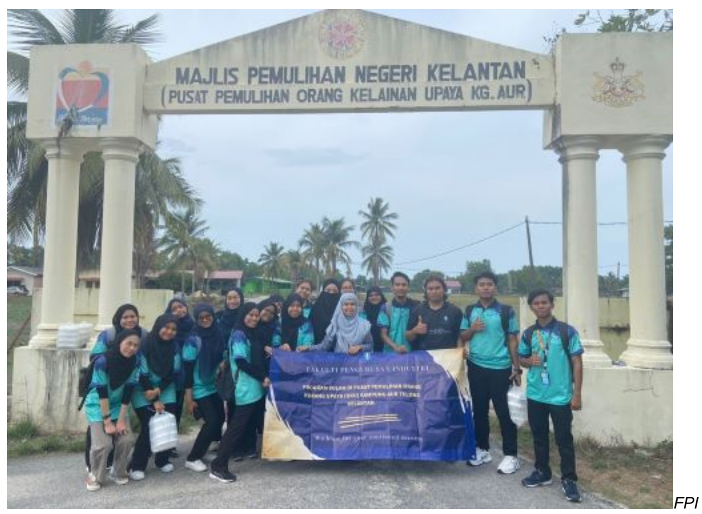
students during the visit to Pusat Pemulihan Orang Kurang Upaya (OKU) Kampung Aur Telong, Kelantan.