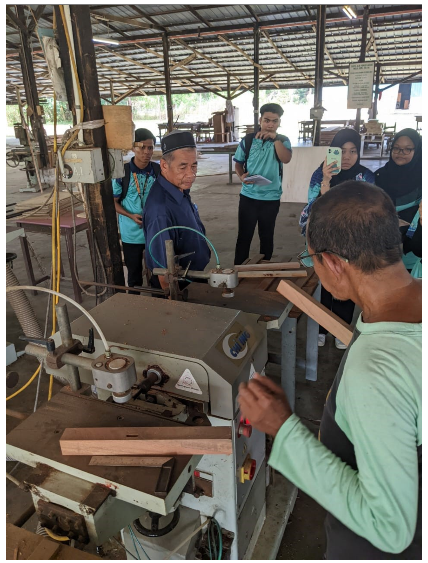
UMPSA's SULAM fosters sustainable community