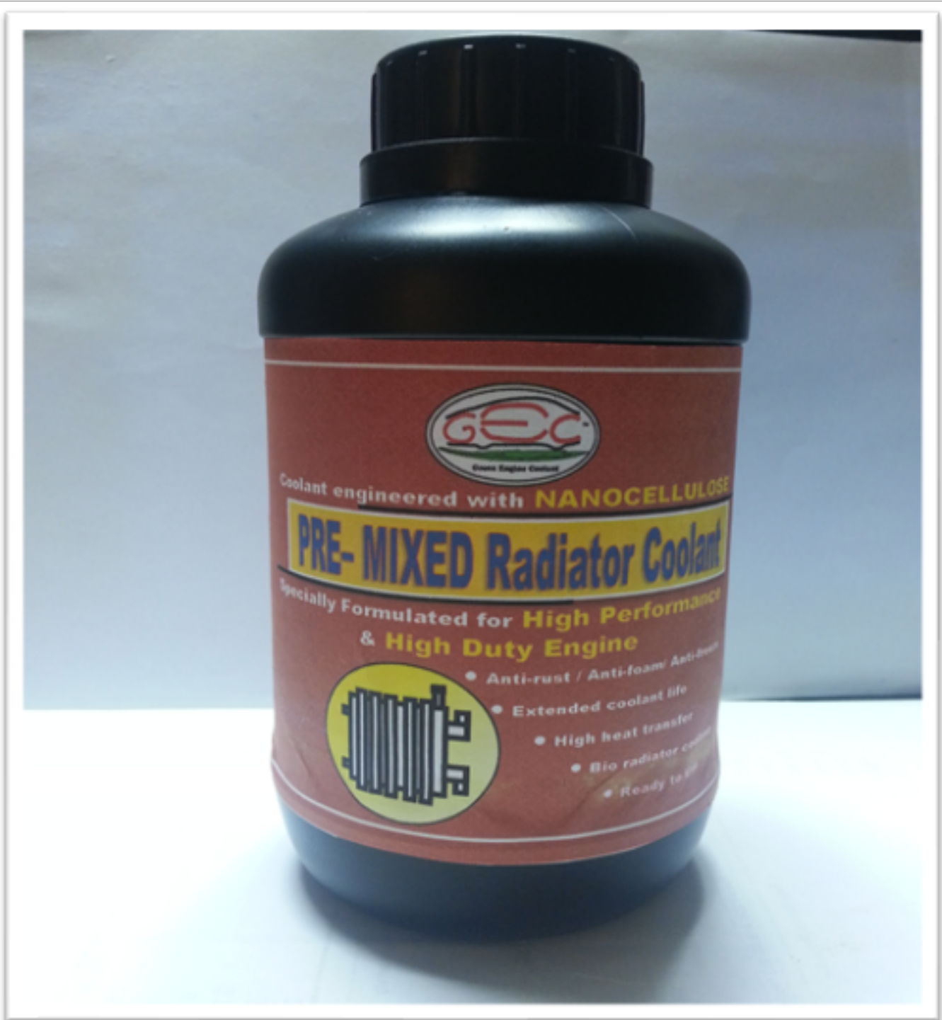
Figure 4: Nanocoolant product made in UMP.