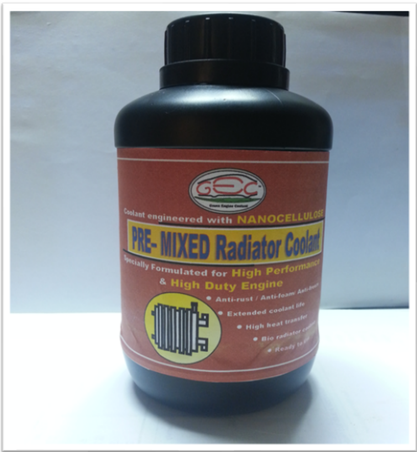
Figure 4: Nanocoolant product made in UMP.