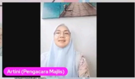
Artini (Pengacara Majlis)