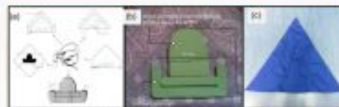
Modification of traditional bandana for the first prototype

A novel protective bandana with shock absorbing material (Polyurethane) was created based on anthropometry data that suits not only forehead, but whole frontal region.